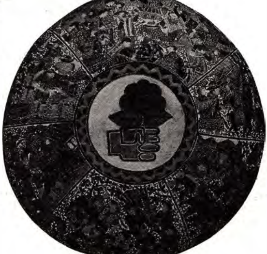
The bowl pictured above, part of the image used on the official poster of the Lima Congress, was made by Peruvian craftspeople.

The struggle for disarmament and the struggle for development cannot be separated, since peace and economic security are inextricably linked: each requires and depends on the other. Thus, Kalevi Sorsa, the Finnish prime