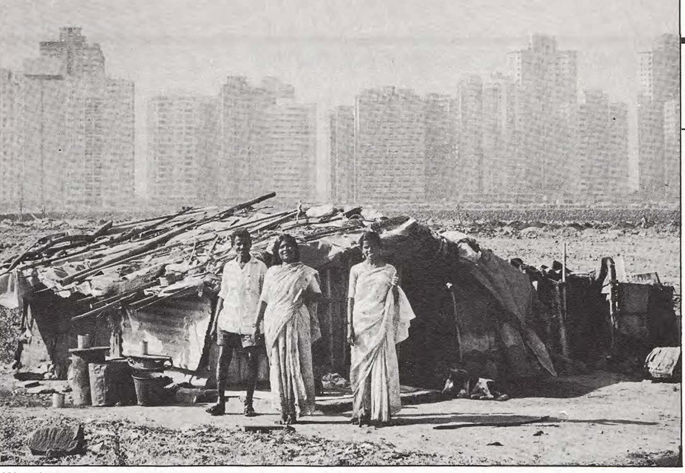
Wealth gap: Construction workers on a housing and office-building site, in Bombay, India

exports and limit imports, and government spending cuts at a time of grievous human suffering. In effect, the masses of the Third World, and of Latin America especially, had to pay with their living standards for debts which had often been undertaken by anti-democratic regimes and had, in any case, been artificially and unfairly increased by the anti-inflation policies of western conservatives.