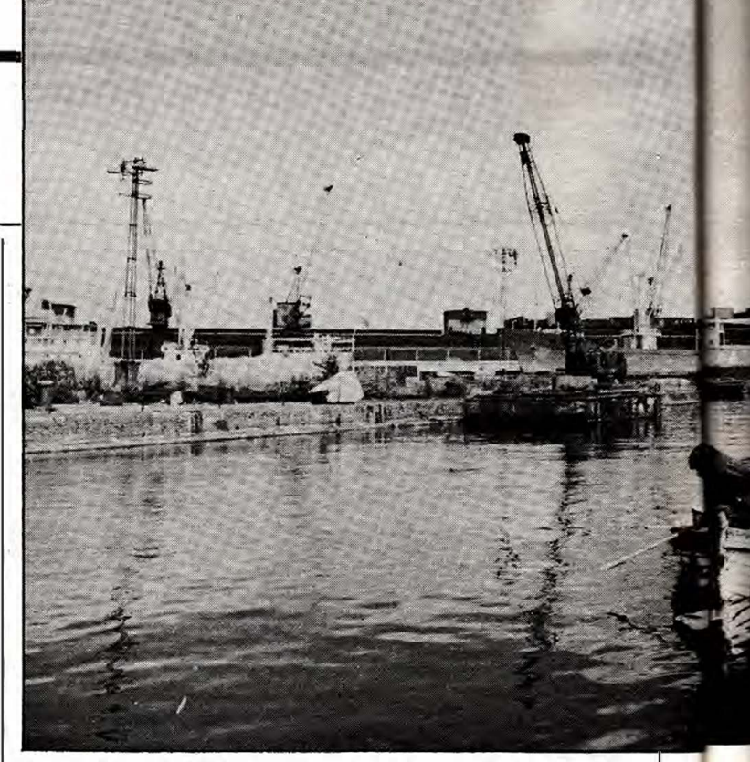
Industry adrift: Unemployed fishing for eels in London docklands

he fate of our globe may well depend on whether a new mode of coexistence can be achieved between the two nuclear superpowers, something of which recently one could